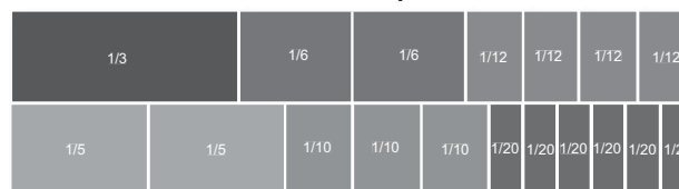
Fraction Strip #2