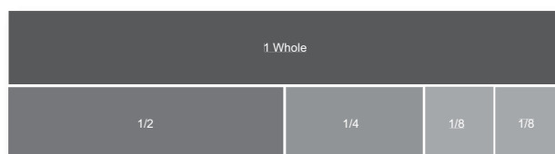
Fraction Strip #1