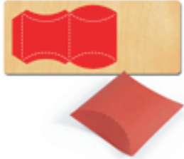
Ellison Die Double Cut - Box #3 (#12452)