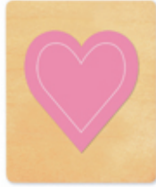
Ellison Die Heart #1A- SM size (#13612)