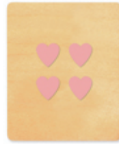
Ellison Tiny Die - Tiny Hearts (#13622)