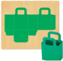
Ellison SureCut Die-Bag #1 (#12152)