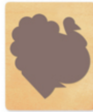
Ellison SureCut Die-Turkey #1 (#15168)