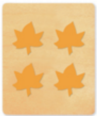
Ellison SureCut Die-Tiny Leaves (#13803)