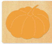
Ellison SureCut Die-Pumpkin #2 (#23813)